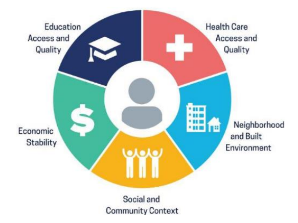
FIGURE 1 Social Determinants of Health

racism are forms of racism that are pervasively and deeply embedded in systems, laws, written or unwritten policies, and entrenched practices and beliefs that produce, condone, and perpetuate widespread unfair treatment and oppression of people of color, with adverse health consequences.<sup>6</sup>