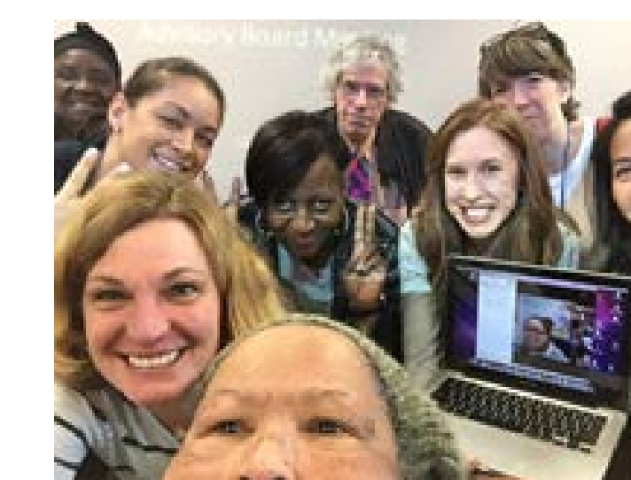
Advisory Board "selfie"